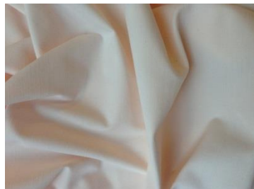
Meryl® Sublime FDY 44f96 FD RD

Beyond its finest filaments ever produced, Meryl Sublime can be provided in 10 different dope dyed colors: Black, White, Grey, Ivory, Biscotti, Stock Blue, Rouge Pink, Flame, Camel and Deep Sky Blue.